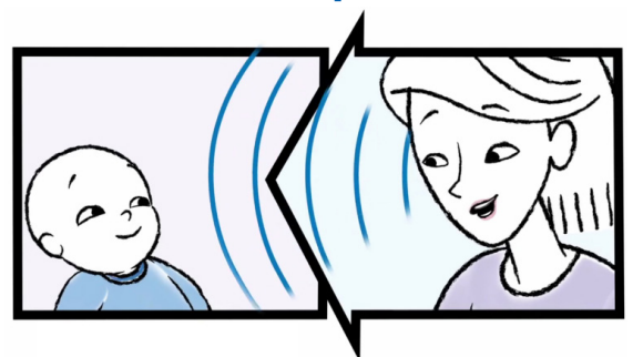
Receptive skills are what babies take in – hearing and understanding