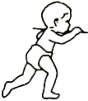
*Pull to stand

1g. IN YOUR OPINION, looking at EXAMPLE 4, at what age would you expect a baby to achieve this skill?