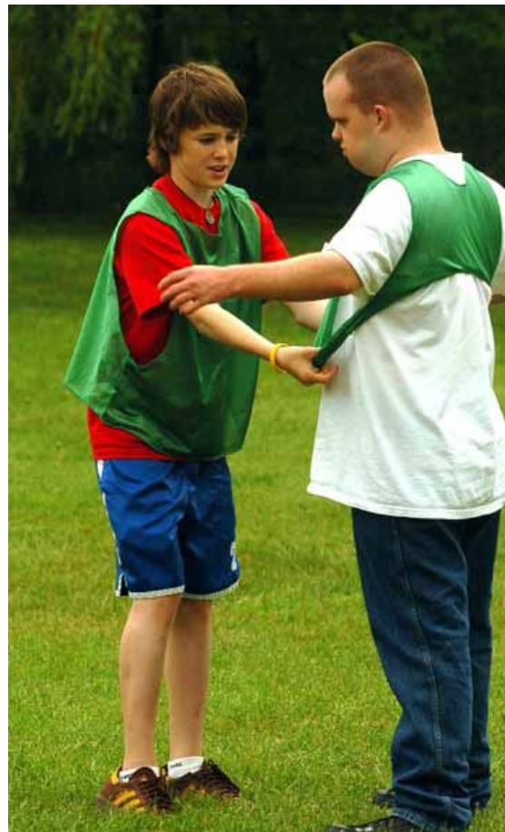
Soccer photos by Art Vassy, Courtesy of Sun-Times Media / Southtown-Star