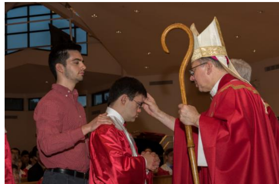
Three students from the Adaptive Needs Faith Formation program at Mother Seton parish were confirmed this past year.

Mother Seton parish started an Adaptive Needs Faith Formation program in the fall of 2016. The program is tailored to each individual student's needs and abilities. Some of the students find sustained activities challenging so the program director wanted to provide quality sensory materials for breaks for these students. Religious themed puzzles and games, thera - putty, kinetic sand, scooters and balls are some of the items that will be purchase with their Open Hearts Award grant.