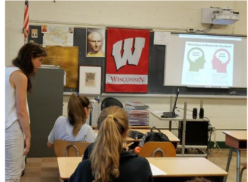
Regina Dominican High School will use their Open Hearts Award grant to support students with special learning needs in inclusive classrooms.