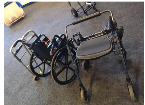
Wheelchairs and walkers are available for congregants' use at Beth Emet The Free Synagogue.

Beth Emet The Free Synagogue has worked on both physical as well as attitudinal barriers to including people of differing abilities in synagogue life. Students with special needs are integrated into their religious education program with the support of a learning specialist. Plans are in place to improve the entrance and sanctuary to accommodate members with physical disabilities.