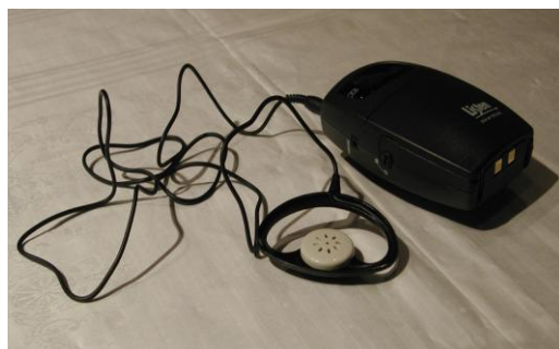
Melrose B'nai Israel Emanu-El will use their 2017 Open Hearts Award grant to purchase assistive listening devices

Melrose B’nai Israel Emanu-El is known as “the little shul with a big heart.” Celebrating its 60th anniversary this year, the congregation moved to ground level, accessible facilities six years ago in order to better welcome people with mobility needs. The inclusion committee at Melrose B’nai Israel Emanu-El Synagogue enhances a warm welcoming environment that affirms the dignity of all congregants and guests. They have seen that gluten-free and sugar-free choices are provided at Kiddush and events where food is served. Large print prayer books, flexible seating and accessible parking spaces near the main entrance are also available at the synagogue. An accessibility evaluation by nearby Center for Independent Living resulted in plans to obtain a portable, wheelchair accessible Torah Table to be used by everyone in the congregation. A plan to create an accessible bathroom by reconfiguring existing space is also underway as a result of the independent evaluation.