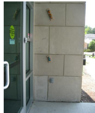
Additional, lower mezuzah by the entrances accommodate members who use wheelchairs at Temple Beth-El.

Temple Beth-El applied for a 2017 Open Hearts Award grant to offset the cost of a $15,000 renovation to their existing sound system and to hire a sign language interpreter for Shabbat services and next year's High Holiday services. The goal is to improve the prayer experience for people with hearing loss while exposing the entire community to sign language interpretation.