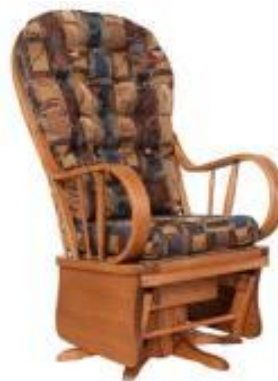
Fredericktown United Methodist Church will use their Open Hearts Award grant to create three pew cutouts furnished with gliding armchairs.