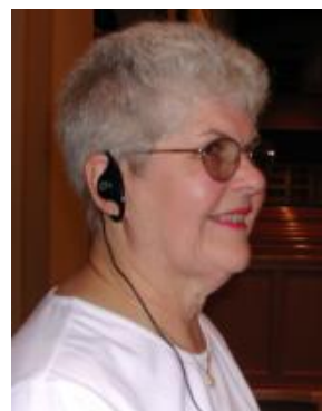
St. Catherine Laboure parish will use their Open Hearts Award grant to expand their assistive listening devices to their social hall.