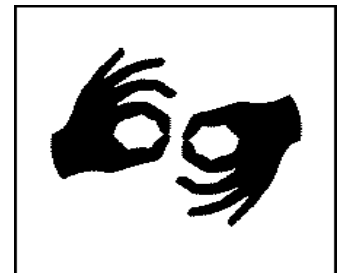
A TEAM W Grant will allow Mishkan Chicago to expand sign language interpretation services.

“This year our TEAM W grant will allow us to continue to