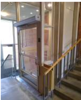
A 2019 TEAM W Award will help fund a lift/elevator to the education wing at Lake Harriet UMC, Minneapolis, MN.

Lake Harriet United Methodist Church (LHUMC) is a vibrant, welcoming congregation in Minneapolis, Minnesota. Since its organization in 1907, LHUMC has welcomed all, and felt a call to social action and outreach. The church parking lot features accessible parking spaces, sidewalks and entrances with curb-cuts and a drop-off area at the main entrance with an automatic door opener. The accessible church building has an elevator offering access to all three levels, ADA-accessible water fountains and bathrooms, an accessible seating area, pew cut outs as well as a ramp to the altar. A hearing loop, large print worship aides, live streamed worship services and a sermon podcast on the website are also available. Funds received from a TEAM W Grant will be used to help