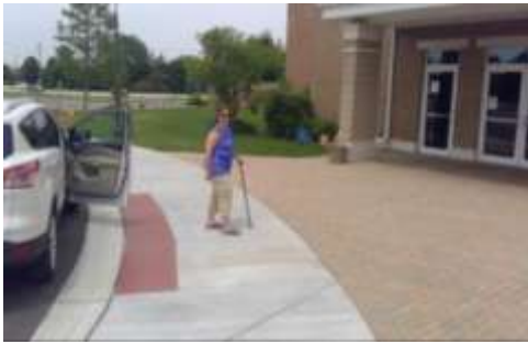
Christ the Servant Catholic Church will use the 2019 TEAM W Grant to help offset the cost of a new circular drive with an accessible drop off area.

Christ the Servant Catholic Church is home to about 750 families. The accessible church has a ground level entrance, accessible meeting rooms, accessible washrooms and accessible offices. Free standing chairs rather than fixed pews provide flexible seating for individuals who use wheelchairs. An accessible prayer garden with accessible walkways is also available. As the parish population increased, it was evident that a larger parking lot with updated access features was needed. A circle drive with an accessible drop off area and