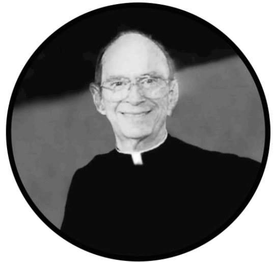
Joseph Cardinal Bernardin Archbishop of Chicago 1982-1996