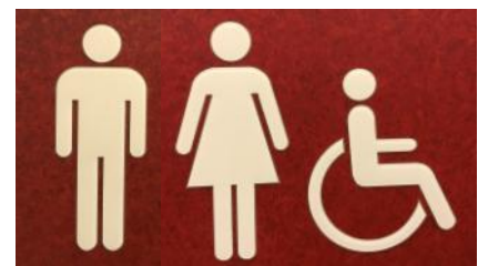
St. John Berchmans Catholic Church will use their That Every Ability May Belong Award grant to upgrade the washroom nearest the worship space for members with disabilities.

At St. John Berchmans Catholic Church, the parish motto, "All Are Welcome," drives efforts to create an accessible and welcoming parish plant. The congregation raised funds to install a two stop elevator to the upper level church and the lower level hall. Accessible washrooms in the lower level church hall and a ramp to the altar are also available. The 2018 Pathways.org That Every Ability May Belong Award grant will be used to renovate the washroom nearest the worship space. Parishioners who need an accessible washroom will no longer have to travel an extended distance to use the accessible washrooms in the church hall.