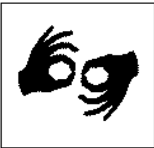
Mishkan Chicago will provide a sign language interpreter for worship services with their That Every Ability May Belong Award grant.

Mishkan Chicago, a Jewish faith community in Chicago, meets for musical prayer, learning and holidays in synagogues, homes and event venues all around the city. The community will use the 2018 That Every Ability May Belong Award grant to help defray the cost of providing sign language interpretation for Shabbat services, High Holidays and other Jewish holidays throughout the year. Individuals who are deaf have expressed appreciation for the interpreter service and parents of children with ADD have stated that having the interpreter present helped their loved one stay engaged in the liturgy.