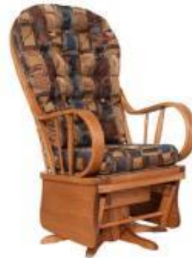
to create three pew cutouts furnished with gliding armchairs.