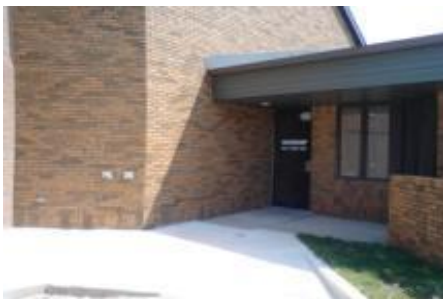
The Wittenberg Lutheran Campus Center will use their That Every Ability May Belong Award grant to help fund automatic door openers on two exterior entrances.

Wishing to be accessible to all, the center has redesigned the parking lot to provide accessible parking adjacent to entrances and provides a sign language interpreter for services.